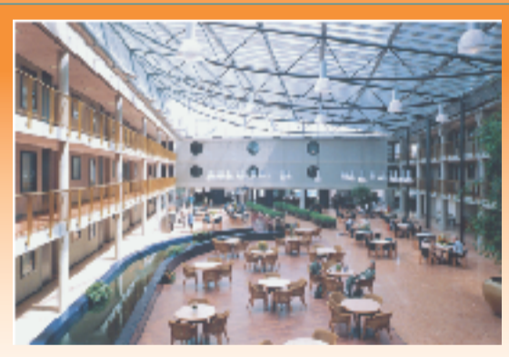
The atrium as an indoor meeting-place

We think that the traditional provisions, such as residential and nursing homes, should no longer be built. Basically, every home should be 'for life'. It is financially attractive, but of course it is the people that count. And they, our existing projects prove it, are much the better for it.