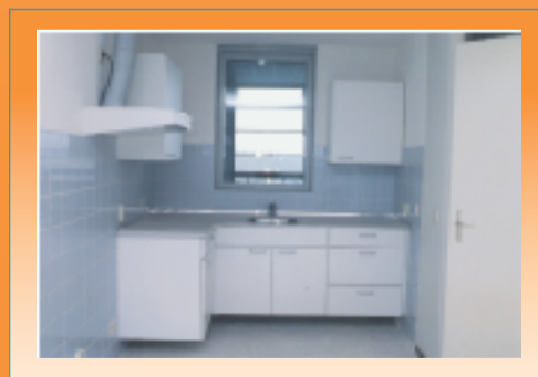
The sink-unit can be dismantled and adjusted