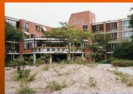
1981 Bertus Bliekhuis