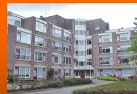
1981 De Steenplaat