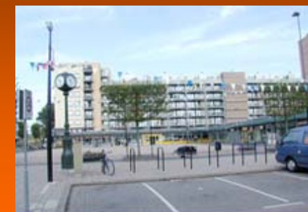
1975 Herman Visserhuis