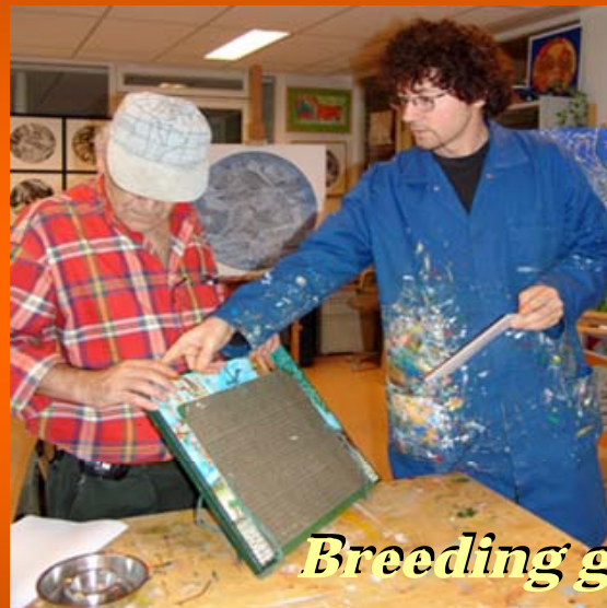
Breeding ground of art