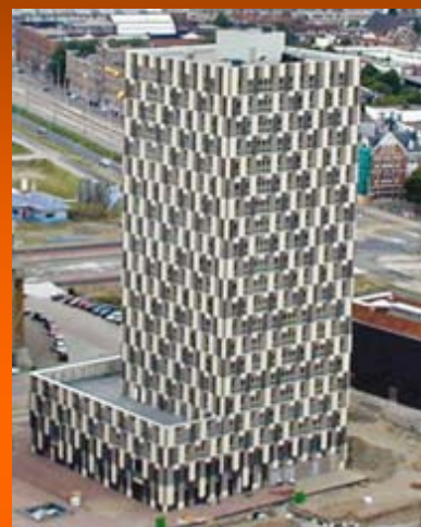
2004 Witte de With