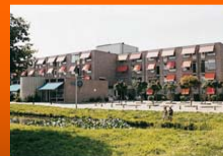
1989 De Wetering