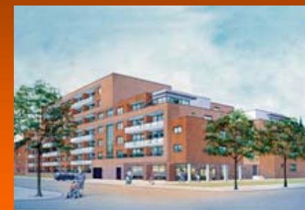
2005 Het Bourgondische Hof