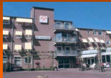
1985 De Evenaar