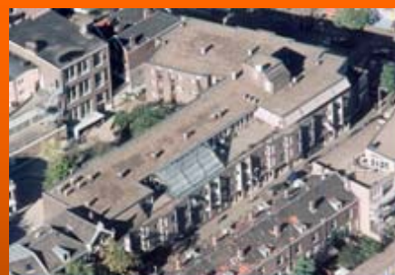
1978 De Leeuwenhoek