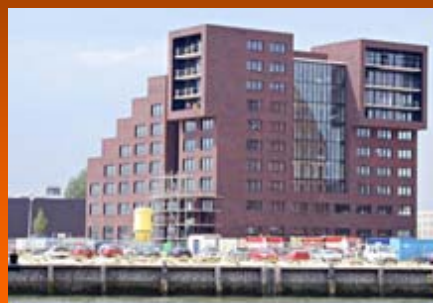
2004 Aert van Nes