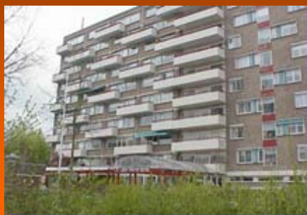
1964 Jan Meertensflat