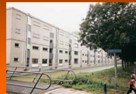
1986 De Carnissedreef